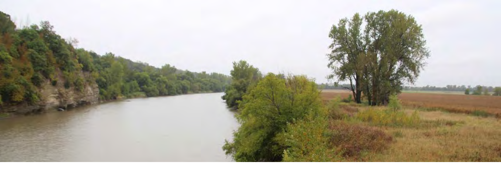
The Great Nemaha River on the Sac and Fox Nation's reservation, which straddles the state line between southeast Nebraska and northeast Kansas.

Finally, the third story features one of nine grantees participating in our HERO Project, Sunflower Foundation's "Healthy Eating: Rural Opportunities" (HERO) program. Many communities across Kansas are facing serious challenges to keeping or reviving their local grocery stores. This is a critical issue for these communities, which are often designated as "food deserts," as the lack of access to fresh, healthy foods affects the health of all residents, especially the most vulnerable. Place matters .