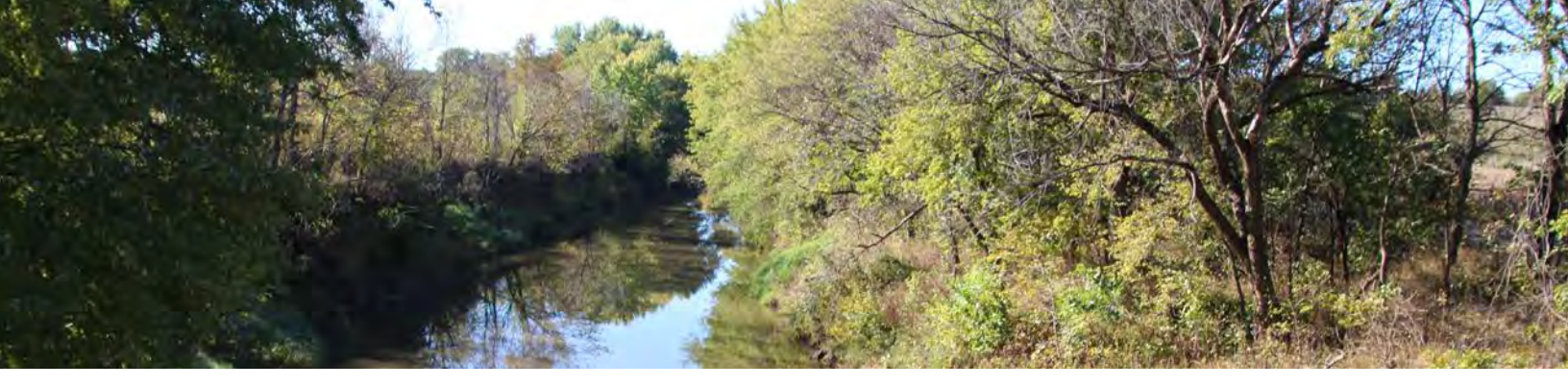
The Delaware River on the Kickapoo Tribe's reservation.