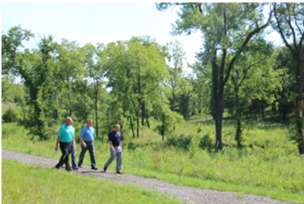
Part of the Lawrence Loop near Rock Chalk park that Sunflower helped complete in 2016. This photo was taken before the .7-mile section was finished with concrete.

And he said grant support like that from Sunflower Foundation not only helps build support on the city commission, it also helps the public understand the connections among outdoor trails, community health and equity. Recently, the Lawrence Pedestrian Bicycle Issues Task Force – volunteer group and partner to the coalition - developed a comprehensive report regarding the walking, biking and wheeling needs and opportunities in the city. Not only did the report stress the health benefits of “active transportation,” it highlighted the importance of accessibility for all residents.