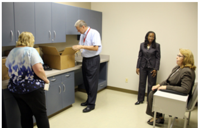
Members of the COMCARE and GraceMed leadership team explore the new integrated care clinic space as supplies began to arrive ahead of the clinic's opening this summer.

The partnership's next step was to apply for an implementation grant from the Sunflower Foundation, which helped launch the integrated care program.