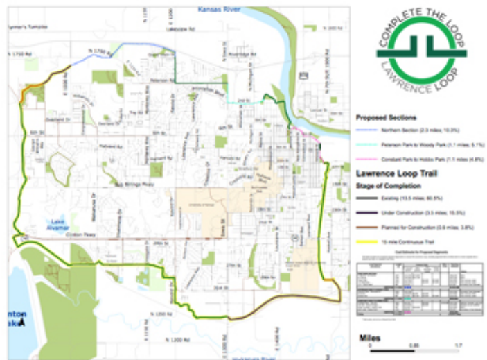
A recent planning map of the Lawrence Loop showing 15 miles of continuous completed trail and several proposed sections.

“Now groups are drawing maps, getting people excited about it, and talking about it as ‘The Lawrence Loop.’ It takes a lot of different people to make this happen,” Hecker said.