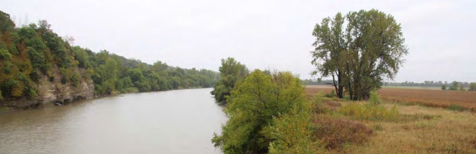
The Great Nemaha River on the Sac and Fox Nation's reservation, which straddles the state line between southeast Nebraska and northeast Kansas.

Finally, the third story features one of nine grantees participating in our HERO Project, Sunflower Foundation's "Healthy Eating: Rural Opportunities" (HERO) program. Many communities across Kansas are facing serious challenges to keeping or reviving their local grocery stores. This is a critical issue for these communities, which are often designated as "food deserts," as the lack of access to fresh, healthy foods affects the health of all residents, especially the most vulnerable. Place matters.