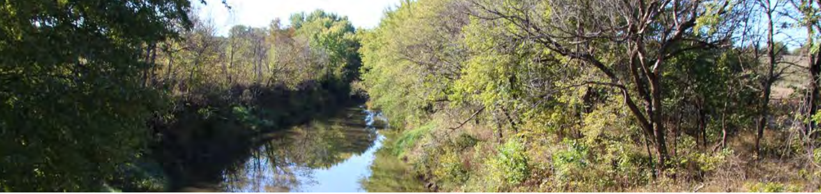
The Delaware River on the Kickapoo Tribe's reservation.